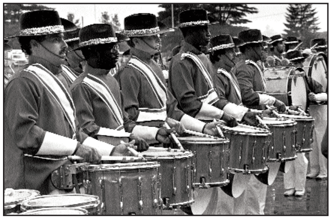
Sunrisers, September 7, 1987

Bennett, Arietano and DeLucia were show designers and arrangers. The staff included