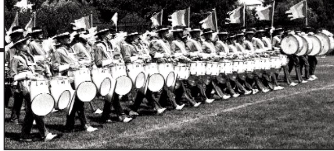
Sunrisers, August 16, 1981.

Procession of the Nobles, the crowd erupted in applause, for it was clear that the Sunrisers had arrived as a championship contender. Sun finished a solid third at DCA Finals that summer. The stage was set for what became the most memorable season the corps ever