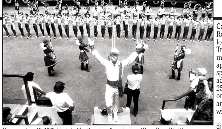
Sunrisers, June 16, 1978.

Great writers notwithstanding, it's the players who actually make the music, and the