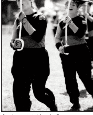
Sunrisers, 1998 (photo by Ron Walloch from the collection of Drum Corps World).

The Sunrisers' name brings memories of one of the most unique, refreshing, innovative and successful corps